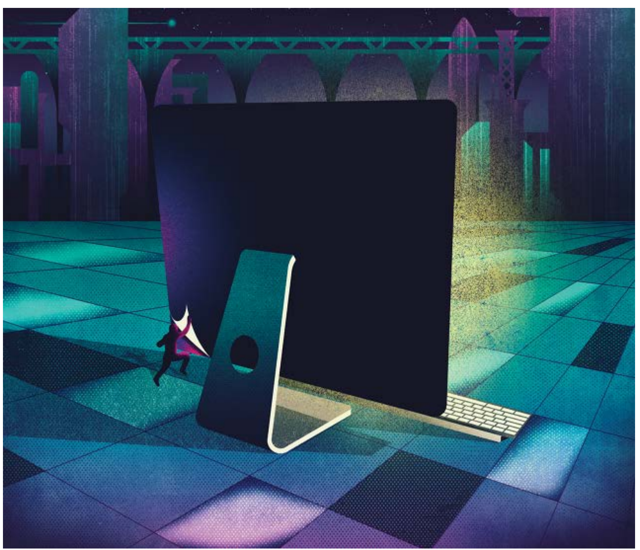
Illustration: Pavlov Visuals

One email—not Y2K—presaged our current cyberhavoc.