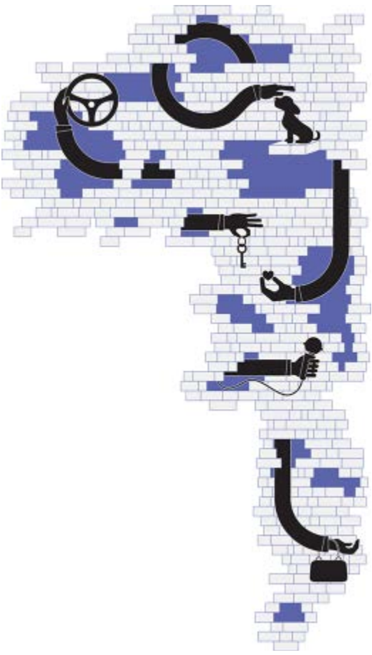
Illustration: Steven Moreau

When Craigslist launched online, it revealed the power—and value—of free information.